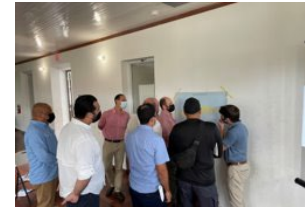
2021 Stakeholder Engagement Meeting

Context: Sandia National Labs performed a conceptual analysis of a microgrid solution for the island’s energy independence and sustainability goals in 2021, incorporating feedback from the community obtained during onsite workshops. Since then, FEMA funding has been identified to build a microgrid. LUMA is taking the lead in designing and implementing the new infrastructure.