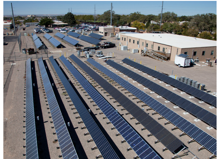
Solar PV array outside DETL