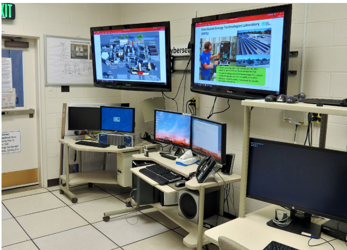
Control room and cybersecurity test bed