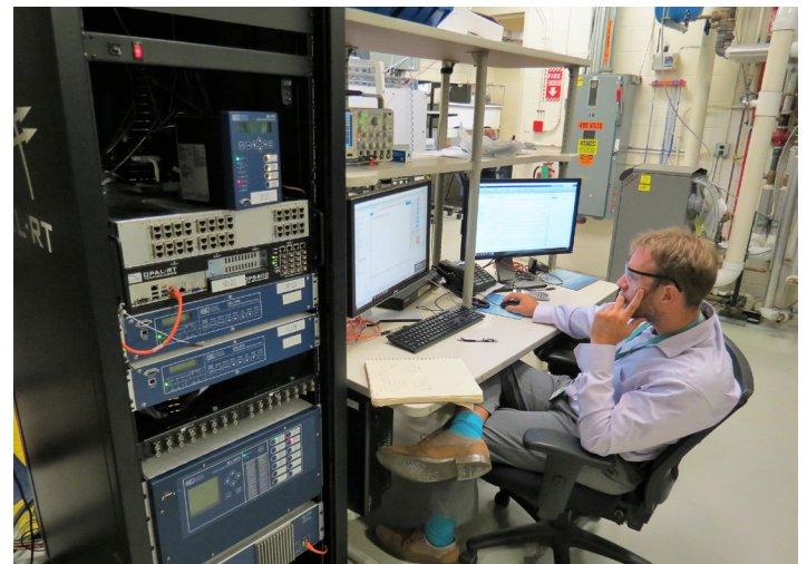
OPAL-RT power hardware-in-the-loop real-time simulation system