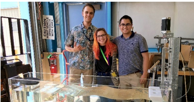
Sandia interns review their summer project.