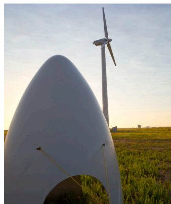
Exchanging rotor components at SWiFT requires minimal time and cost.

Sandia has collaborated with the National Renewable Energy Laboratory, Technical University of Denmark (DTU), and Texas Tech on a wake steering experiment to study the use of wind farm controls to mitigate the impact of wind turbine wakes on farm performance. Researchers characterize the wake location and structure under a variety of inflow and turbine states using DTU's Spinner-LIDAR and instrumentation provided by Texas Tech. The ultimate objective is to calibrate and validate the models to improve predictions of future wind plant performance through the release of public data.