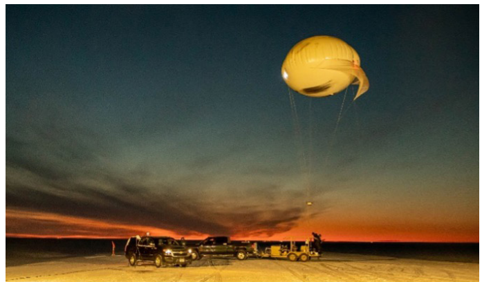
Sandia researchers used the ARM tethered balloon system at Oliktok Point, Alaska, to deploy an automated size and time-resolved aerosol collector (STAC) to measure aerosol particles in the size range of 0.1-0.5 \mu m and with a few seconds' time resolution.