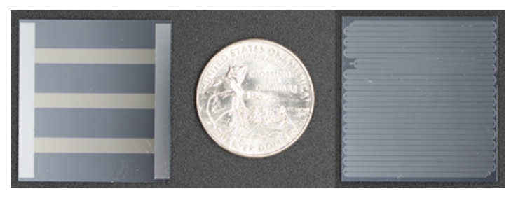
Figure 2. Sandia researchers are working to create a miniature, low-power universal greenhouse gas sensor using micro gas chromatography devices (left and right) about the size of a U.S. quarter (center).

A major forcing factor, permafrost soils modulate Arctic climates and the microbial residents of permafrost that are central contributors to biogeochemical climate feedback cycles. Sandia develops approaches to accurately characterize microbial activities in soil samples critical to defining risks of permafrost soil degradation to chronic and acute climate perturbations. Our scientists are also designing gas measurement platforms to non-destructively determine the sub-surface microbial signatures of permafrost degradation.