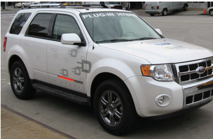
A demonstration Ford Escape PHEV in New York City.

Automobile and truck transportation accounts for about two thirds of U.S. oil use † and ¼ of our greenhouse gas (GHG) emissions. A national energy goal is to reduce CO 2 emissions to 17% of 2005 levels by 2050. ‡ Assuming linear growth from today's [population levels and energy-use activities that lead to] emissions, we must achieve over a factor of seven reduction in CO 2 emissions. Additionally, the nation would like to reduce petroleum usage for transportation by 17% at the end of this decade. ‡