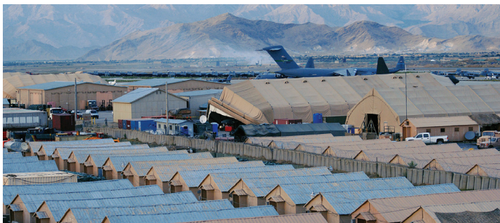
Bagram Airfield, Afghanistan

Sandia uses innovative energy technologies to provide energy solutions to our nation's defense agencies both at home and abroad, including advanced photovoltaics, concentrated solar power, innovative wind energy, water/wave energy, and advanced energy storage.