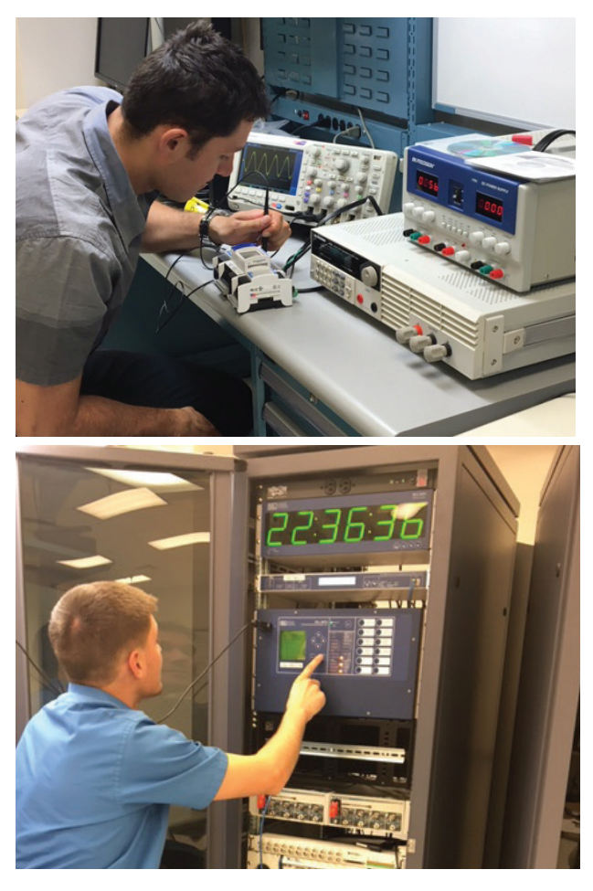
Phasor Measurement Units are used in Sandia's Control & Optimization of Networked Energy Technologies Lab to advance the grid's resiliency and reliability.

LLC, a wholly owned subsidiary of Honeywell International Inc., for the U.S. Department of Energy's National Nuclear Security Administration under